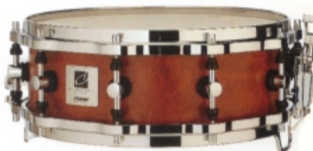
DS 1406 ML RH (African Bubinga)

The large selection of shell materials like wood, seamless ferromanganese steel, brass, and cast bronze offers perfect side-drums for every style and taste. A recently developed strainer, high-quality heads from the Sonor production-line and die-cast rims (on the 14" models) guarantee the remarkably consistent quality of Sonor snare drums.