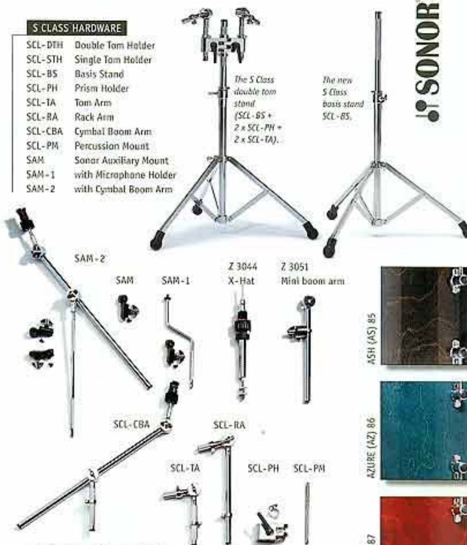
The S Class double tom stand (SCL-BS + 2 x SCL-PH + 2 x SCL-TA).