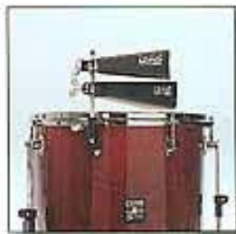
SAM-2 with the new percussion mount for using small percussion.