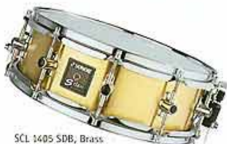
SCL 1405 SDB, Brass