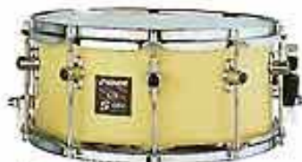
SCL 1406 SD NA, Natural Birch