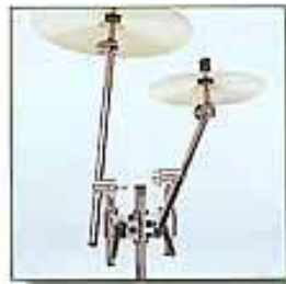
The S Class double cymbal stand (SCL-BS + 2 x SCL-PH + 2 x SCL-CBA).