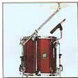
SAM-1 with microphone holder and SAM-2 with cymbal boom arm.