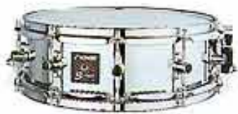
SCL 1405 SDS, Steel