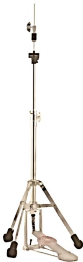
HH LT 2000