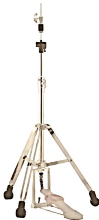
HH XS 2000